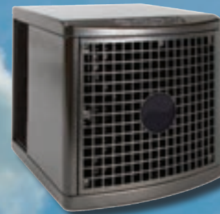
PURE AIR BOX 22K

Great for AC & heating systems in home or business